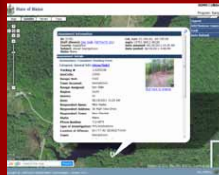
▲ Example of a Forestry site inspection details displayed on a map.